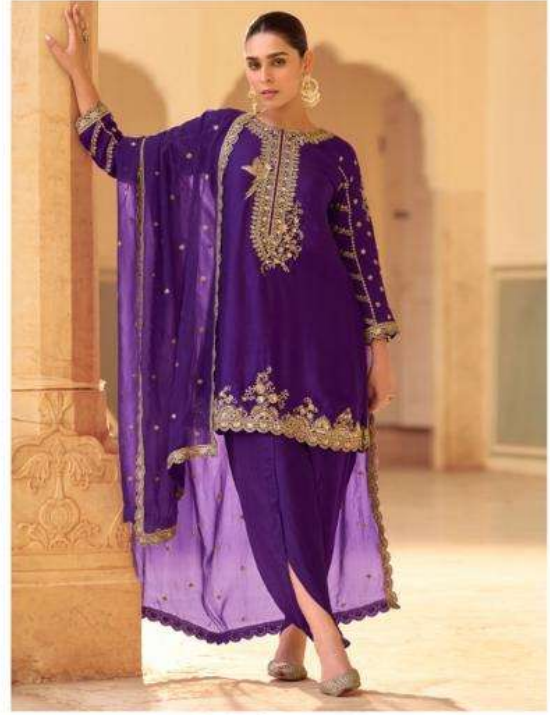
D NO : 5758