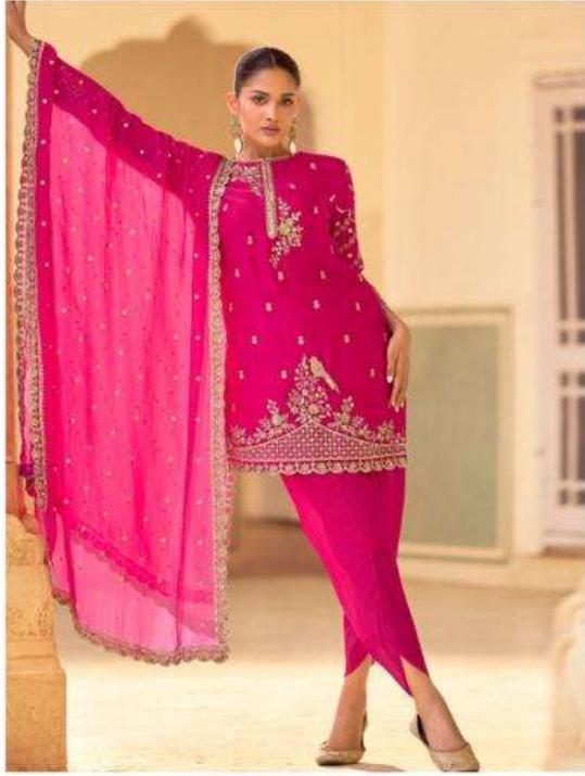
D NO : 5757