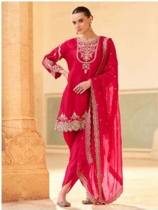
D NO : 5759