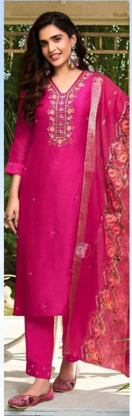
Ghunghat ® VOL-12 4105