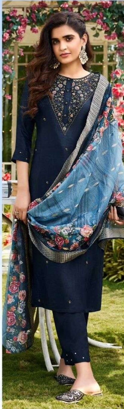
Ghunghat ® VOL-12 4105