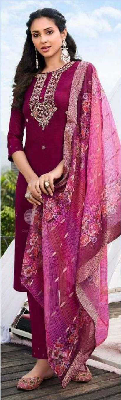
Ghunghat ® VOL-12 4104