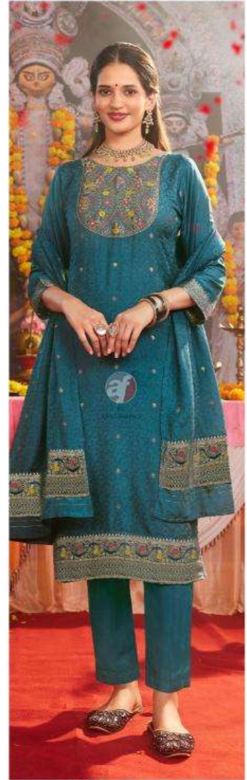
PALKI Vol-04 4043