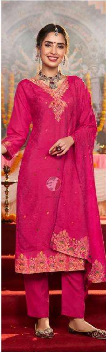
PALKI Vol-04 4041