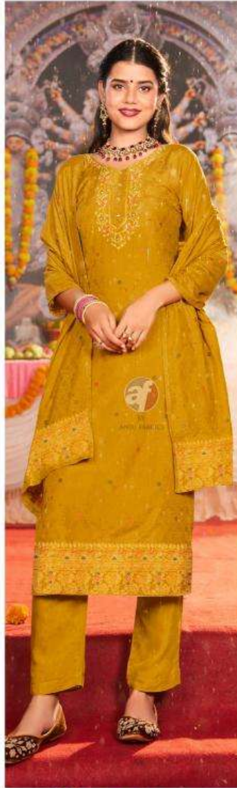
PALKI Vol-04 4042