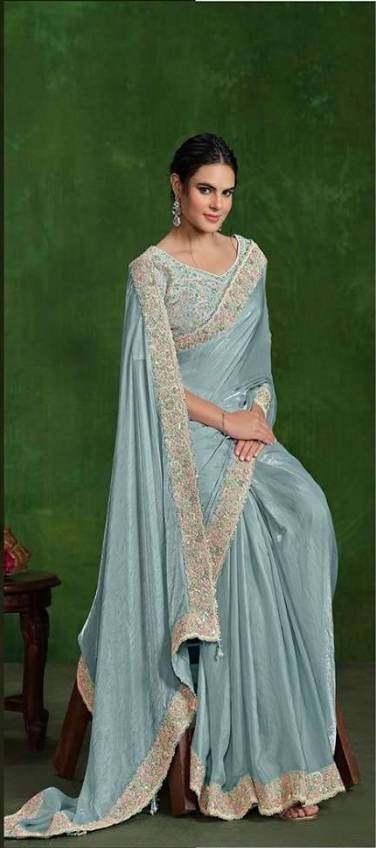
24304 FABRIC : TWO-TONE SIMMER SATIN BLOUSE : EMBROIDERED READY TO WEAR