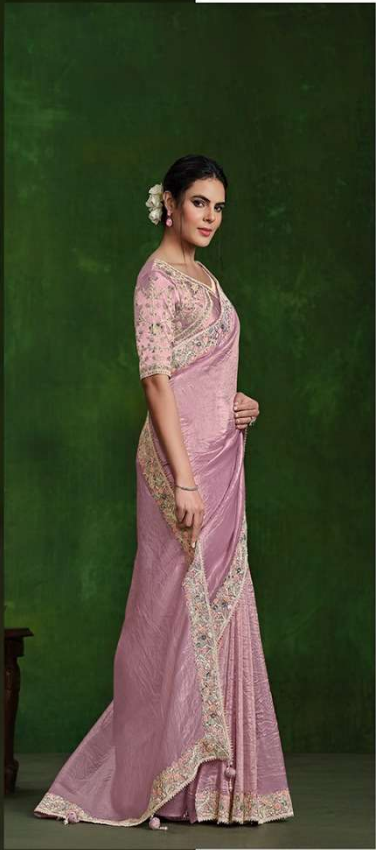
24305 FABRIC : PAPER CREPE SILK BLOUSE : EMBROIDERED READY TO WEAR

Ranjhana - A collection that is specifically curated to make your special moments memorable.