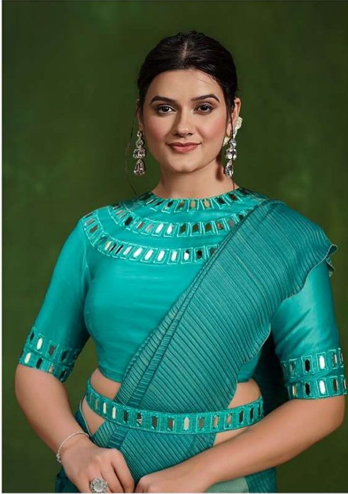
The alluring effect of a masterpiece with intricate beauty makes it an exquisite piece of fashion craft