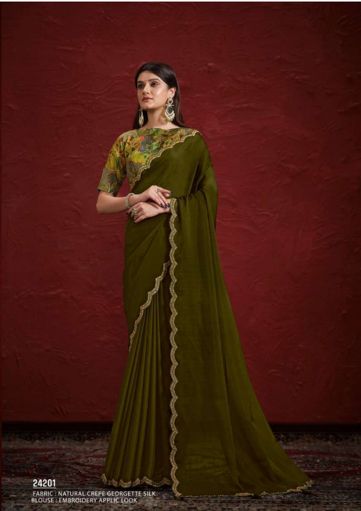
24201 FABRIC : NATURAL CREPE GEORGETTE SILK BLOUSE : EMBROIDERY APPLIC LOOK