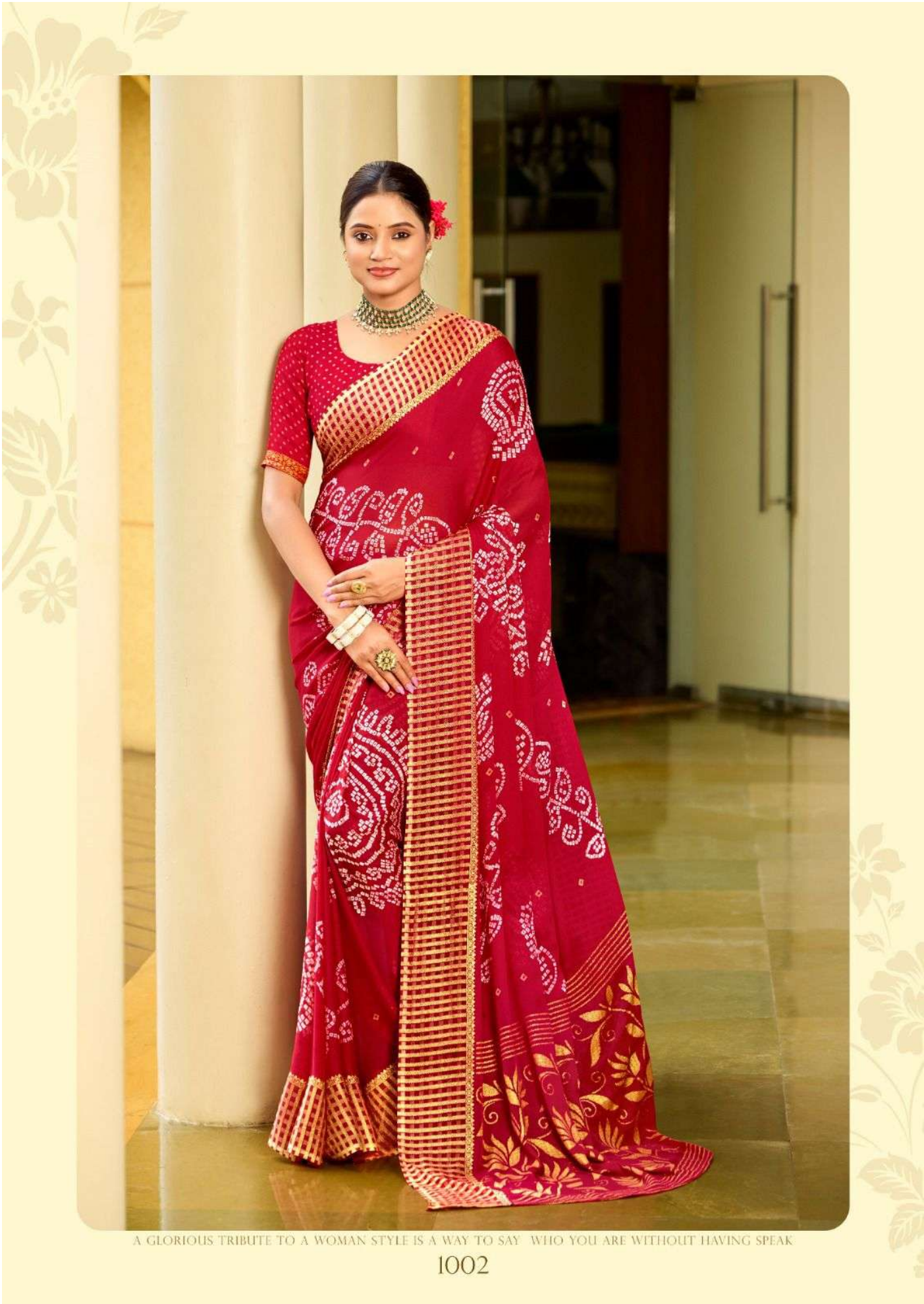
A GLORIOUS TRIBUTE TO A WOMAN STYLE IS A WAY TO SAY 'WHO YOU ARE WITHOUT HAVING SPEAK