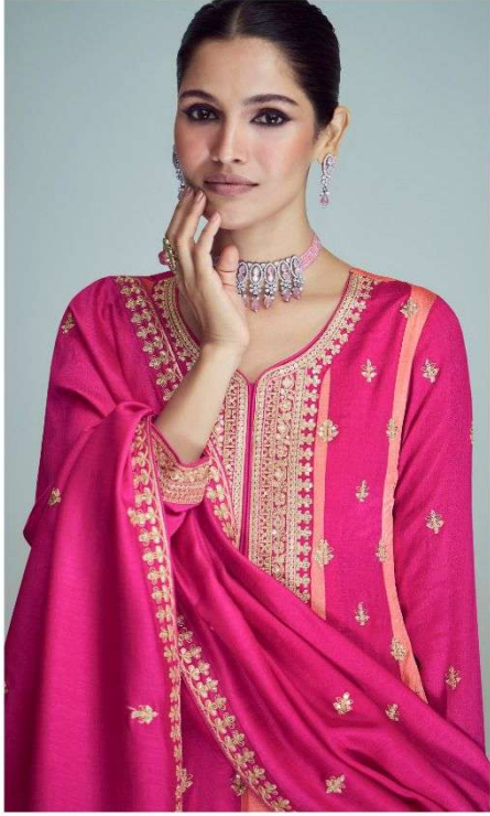
A | -9706