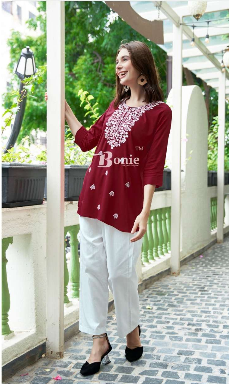
Kurti and Tunic, Indian Fashion Kurti and Tunic are very much in fashion these days. Kurti (Tunic/Top) is just a women's top