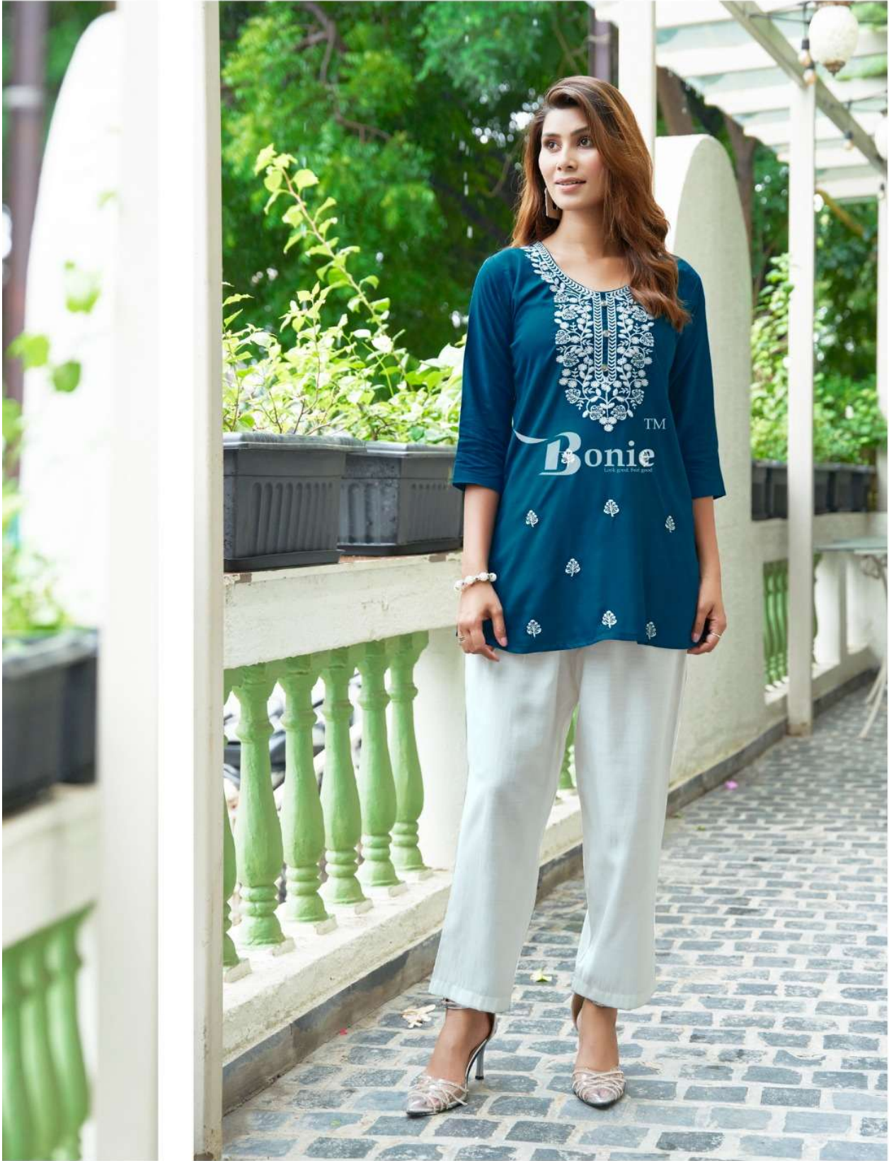
Girls nowadays wear Kurti over jeans, Salwar, Pant, Capri and even a skirt. Indian Kurtis (Tunic/Tops) are accepted worldwide. Kurtis (Tunic/Top) look decent and sincere, versatile and stylish, trendy yet modest