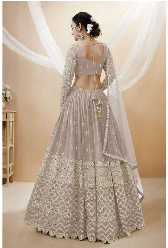
❖ 302 ❖ They say there's something special about her, maybe it's her eyes, maybe it's her smile, maybe, just maybe, in her treasures and clothes, which transform her into a modern day zarparess like never before, she's unmatched in her clan.