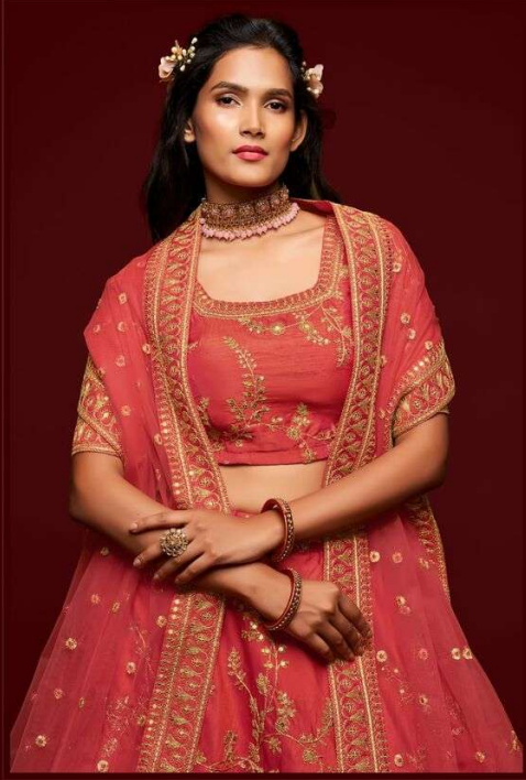
In bold and beautiful, it's a celebration of the spirit of the festival. A lehenga that's a perfect blend of traditional and contemporary, with a touch of modernity. It's a lehenga that's a perfect blend of traditional and contemporary, with a touch of modernity. It's a lehenga that's a perfect blend of traditional and contemporary, with a touch of modernity.