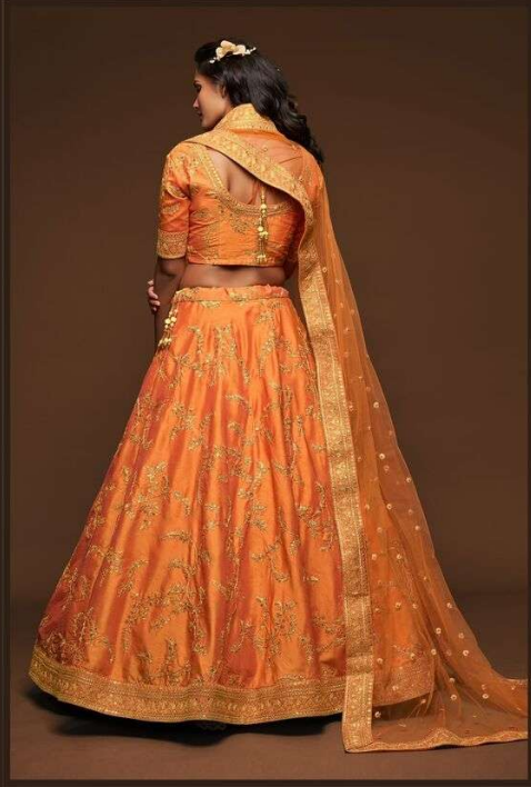
Embrace womanly attire that take inspiration from the feminine of the tradition swathing its way to a season invited with imagination fabulous designs to look beautiful.