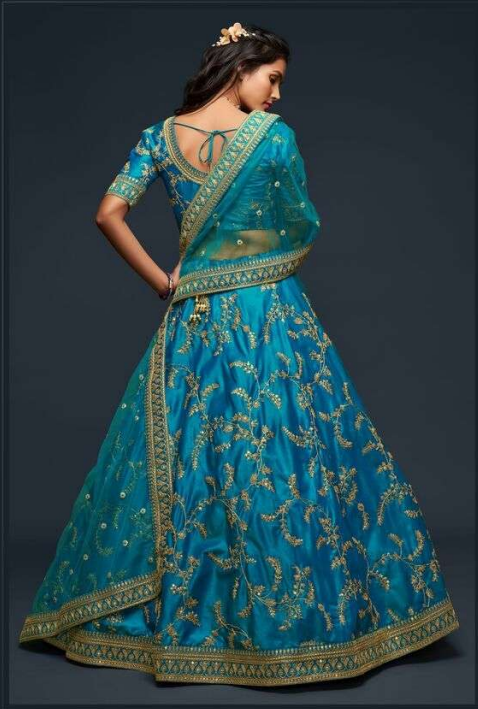
Embrace womanly attire that take inspiration from the feminine of the tradition swathing its way to a season invited with imagination fabulous designs to look beautiful.