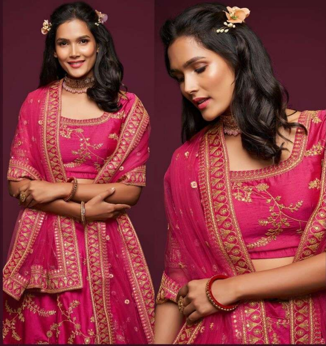
The beauty of the Indian women with gracefully drops in effulgent dresses.