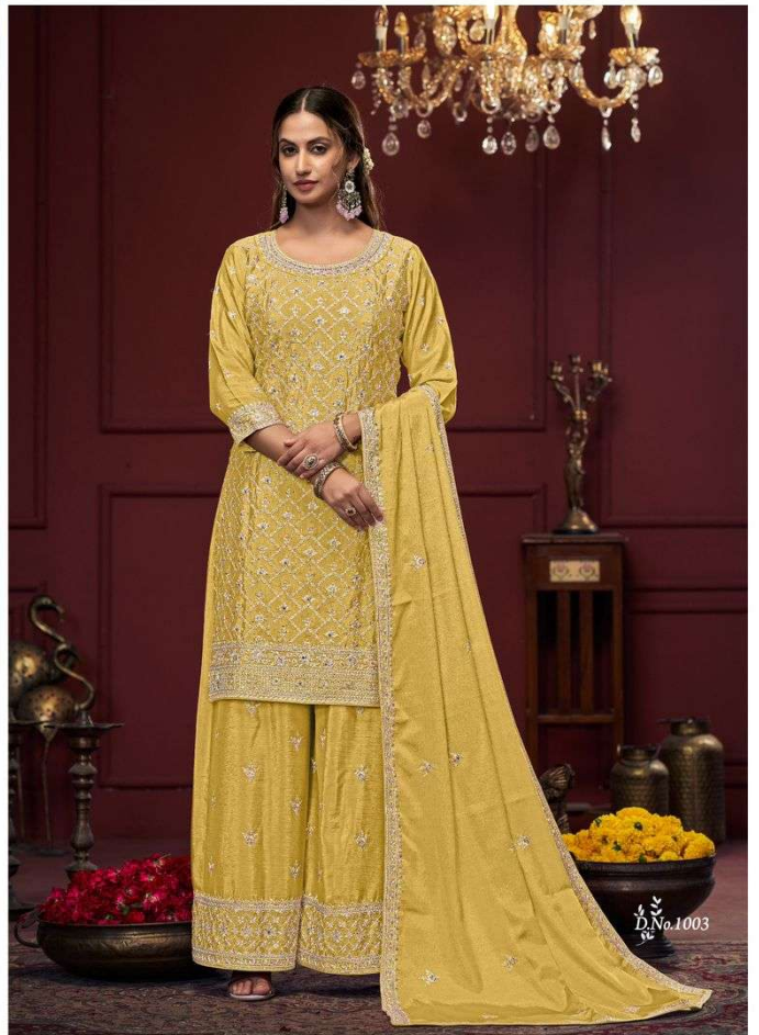
"Fabric's Embroider, Culture's Symphony, Dresses of Quality's Legacy."