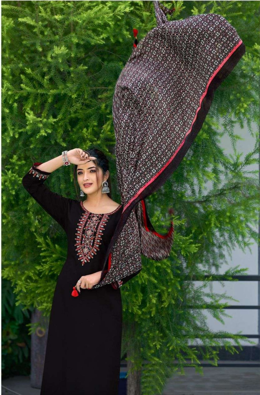
When you want to keep it casual and trendy, go for this orange striped piece because stripe is timeless trend!