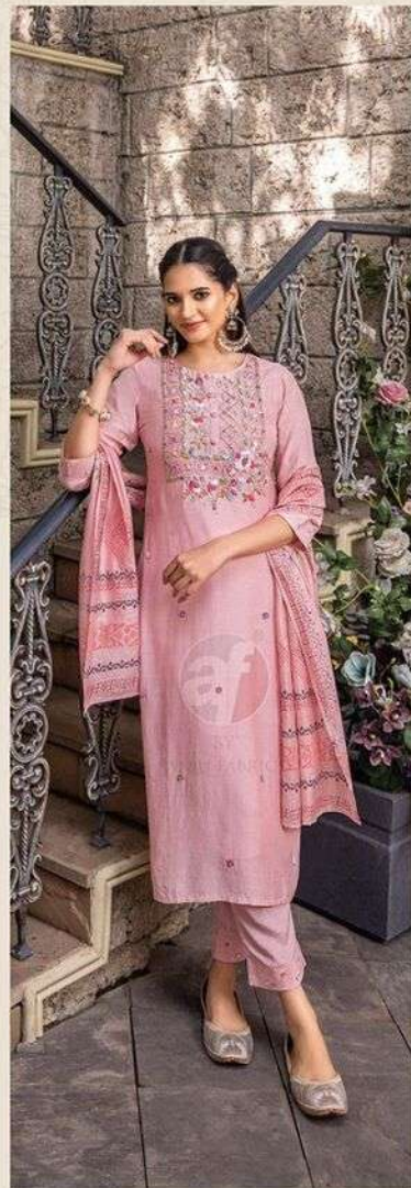
GOLDEN 3636 Meadows