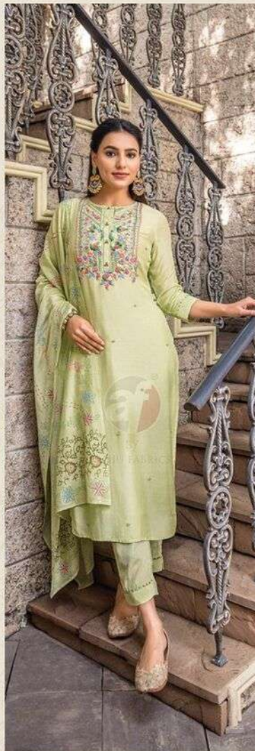
GOLDEN 3632 Meadows