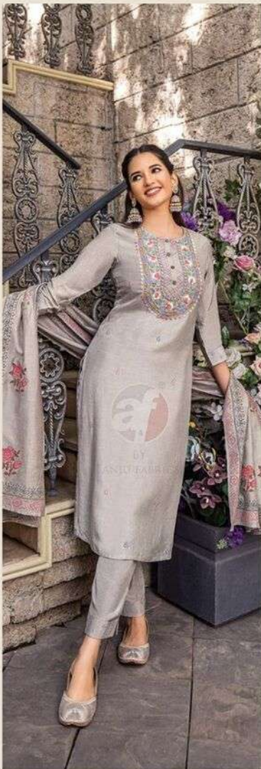
GOLDEN 3634 Meadows