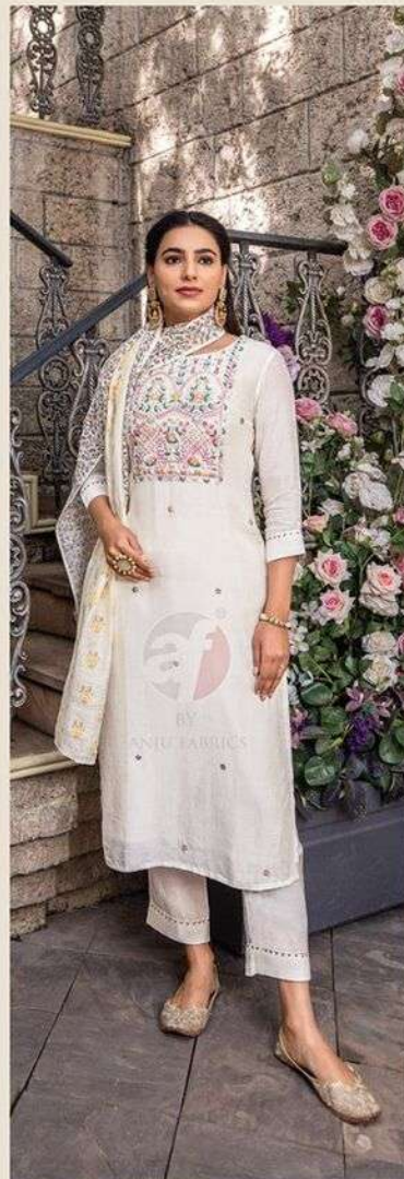
GOLDEN 3633 Meadows