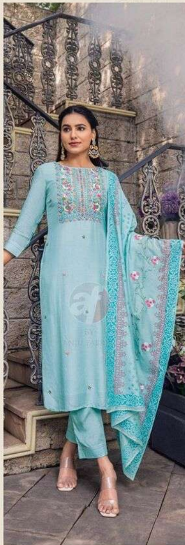
GOLDEN 3635 Meadows