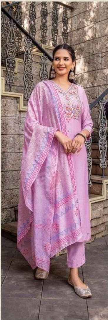
GOLDEN 3631 Meadows