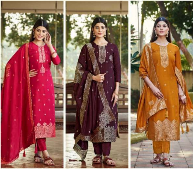
+ 332-001 +