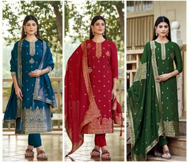
+ 332-004 +