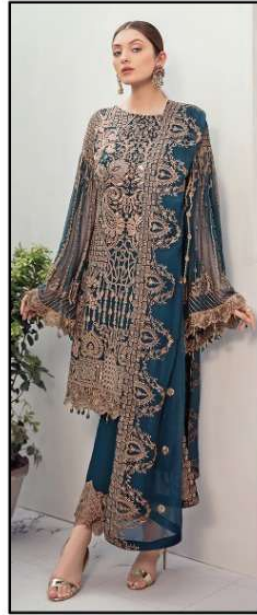
D - 1026 D