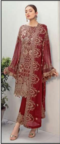
D - 1026 A