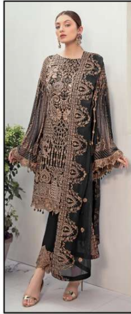
D - 1026 C