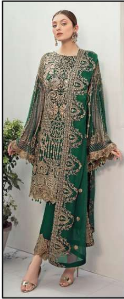
D - 1026 B