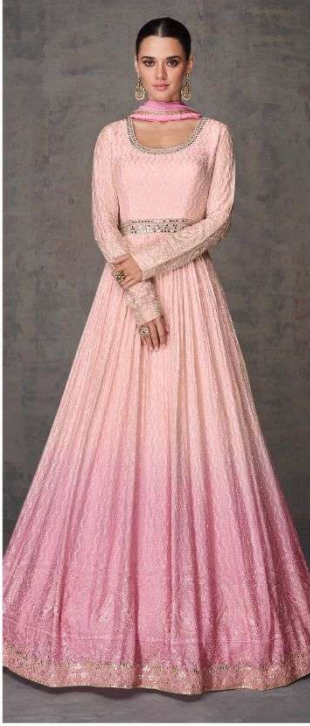
D NO : 5356