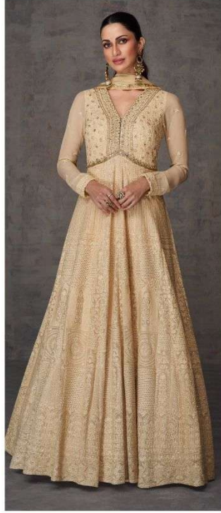
D NO : 5357