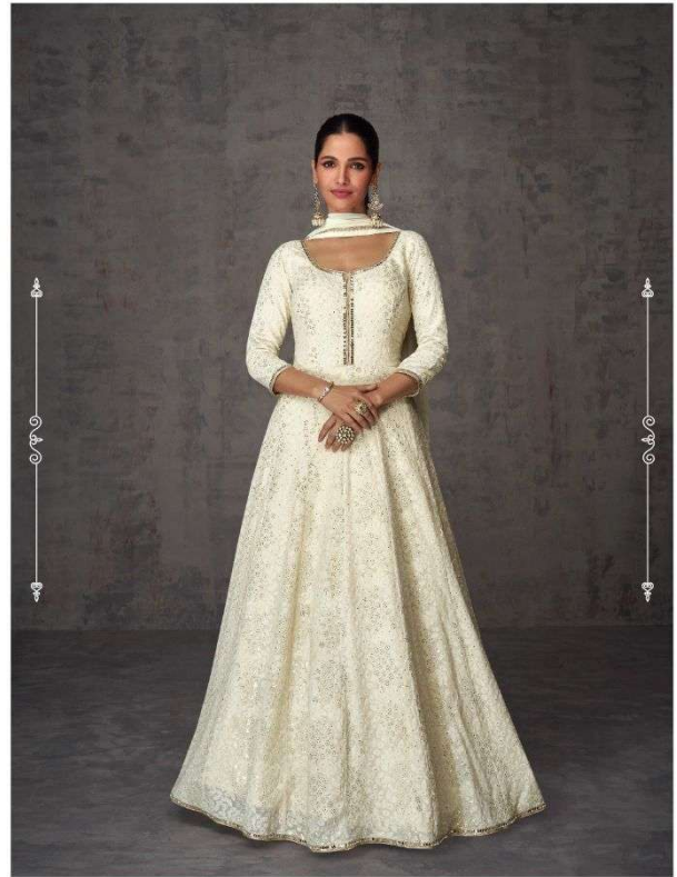
D NO : 5358