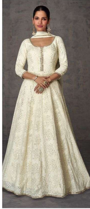
D NO : 5358